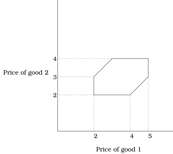
Figure 1: Lattice nature of WE prices

If (p, \mu) is a WE, then p is a Walrasian equilibrium price vector and \mu is a Walrasian equilibrium allocation .