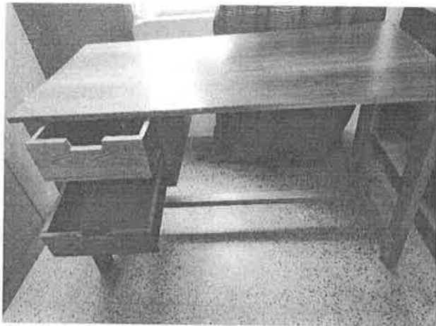
Wooden Table size : (48" W x 24" L)