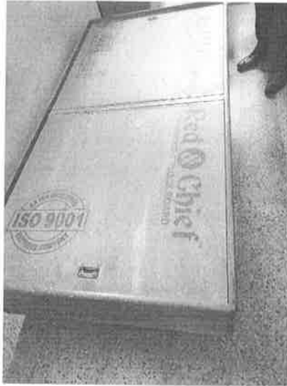
Wooden Bed with Box size ( 36" w x 72" L)