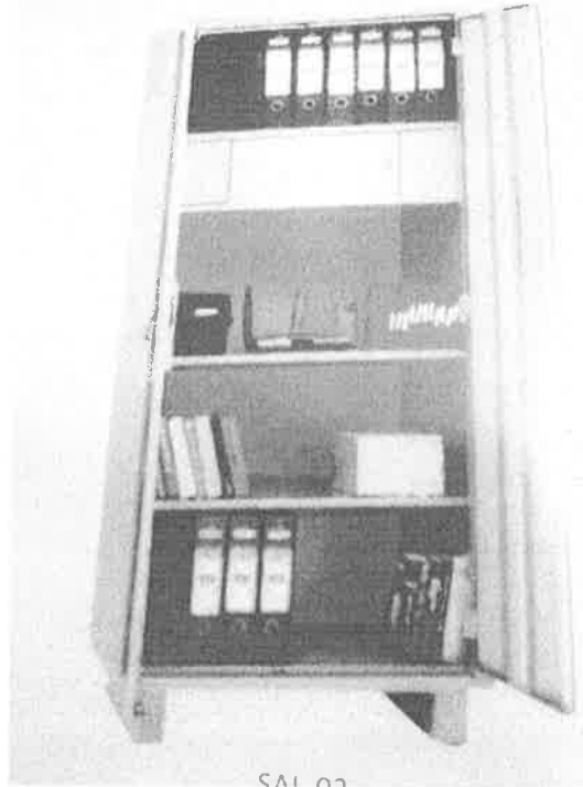
Steel Almirah with 5 shelves in 20 x 22 gage sheet