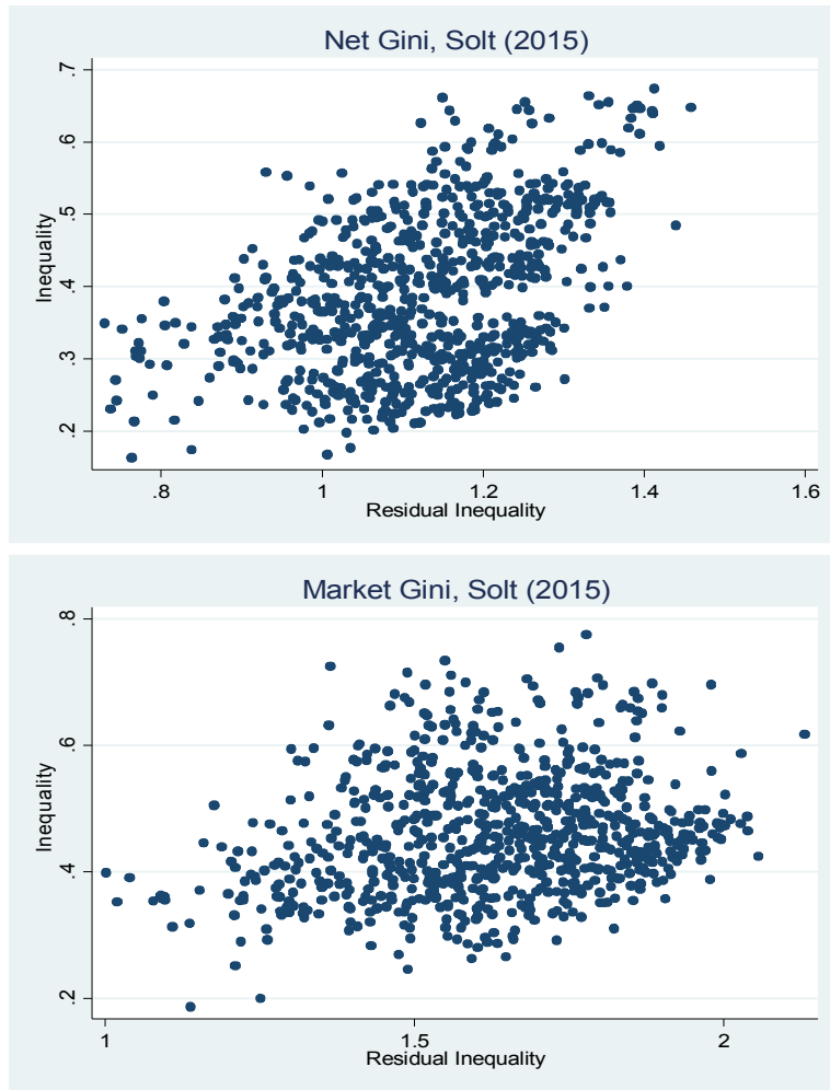
Appendix Figure 1. Residual Inequality and Inequality